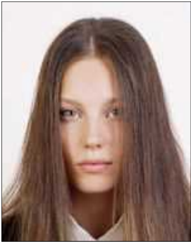
Hair covering eyes