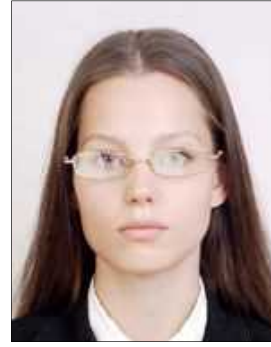
Reflection on lens