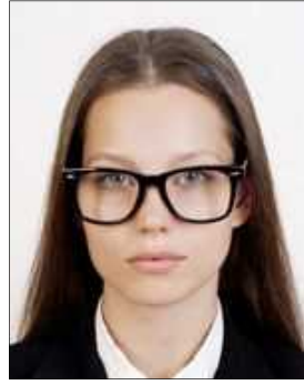
Too thick frames