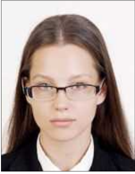
The frames across eyes