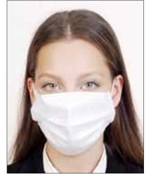
Hide one's face by a mask