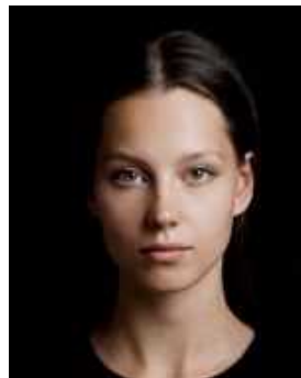
Vaguely-outlined image because of too dark behind