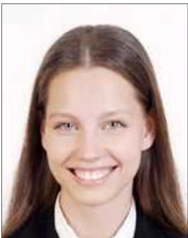
Mouth opens Looks different from normal face expression