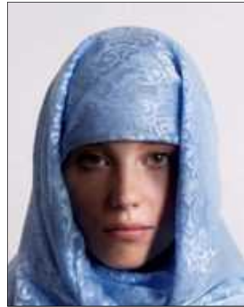
The part of the face is in shade because of head covering. (if there's no shadows and show the full face, head covering is allowed)