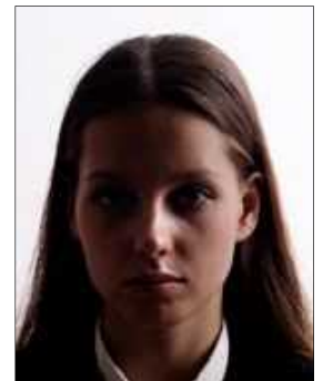
The part of the face is in shade